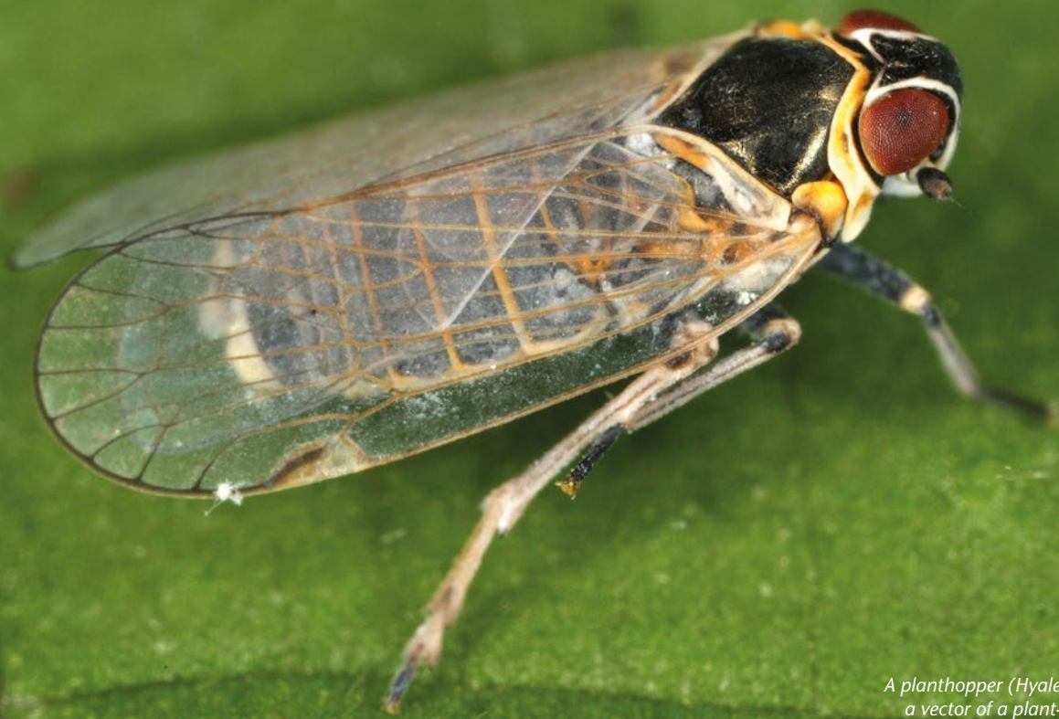
A planthopper (Hyalosthes obsoletus). This species is a vector of a plant-disease in vineyards and therefore of scientific and economic interest.

Use and benefit of laser vibrometry in insect research