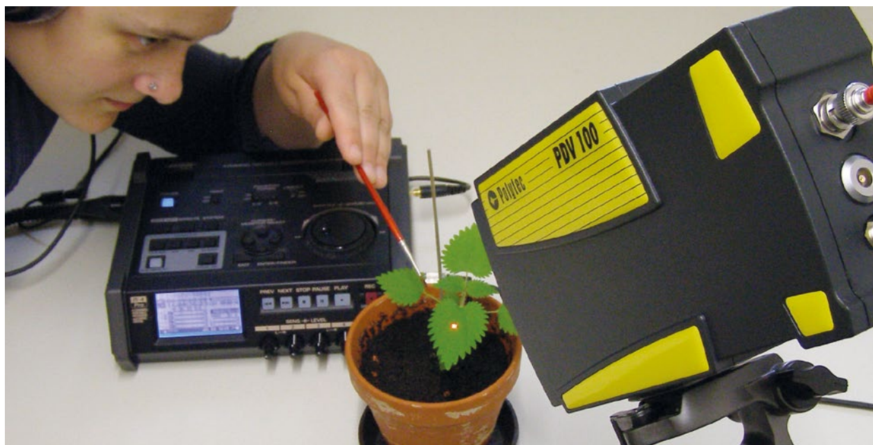
Figure 1: Experimental setup for recording planthopper songs. The vibrations are registered with a PDV-100 laser vibrometer either directly on the animal or on its host plant.

In the past, vibration signals were recorded using very simple methods. The vibrations were made audible by touching the host plant with a gramophone stylus. More recently, piezoelectric transducers were used. The signals could then be recorded on magnetic tape or later on computers. The biggest disadvantage of these methods was that the pickup system had ▶