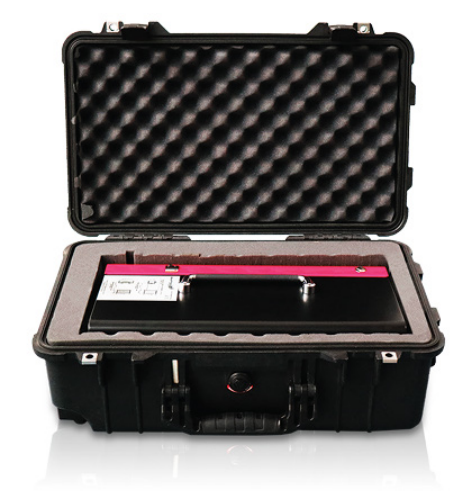
The device fits in hand luggage size restrictions for easier handling

SMARTTECH UNIVERSE combines metrologically verified precision, essential for reverse engineering, with realistic texture and color representation necessary for digitalization purposes. This universal 3D scanner is a complete solution enabling easy creation of 3D documentation of any object for such uses as 3D printing or part modification. Light aluminum casing and carbon fiber framework ensure the best security and stability for sensitive optics, maintaining the lightweight of the device. Each device is supplied with a certificate confirming its accuracy what makes this 3D scanner a referential measuring tool for both — technical and natural — science industries.