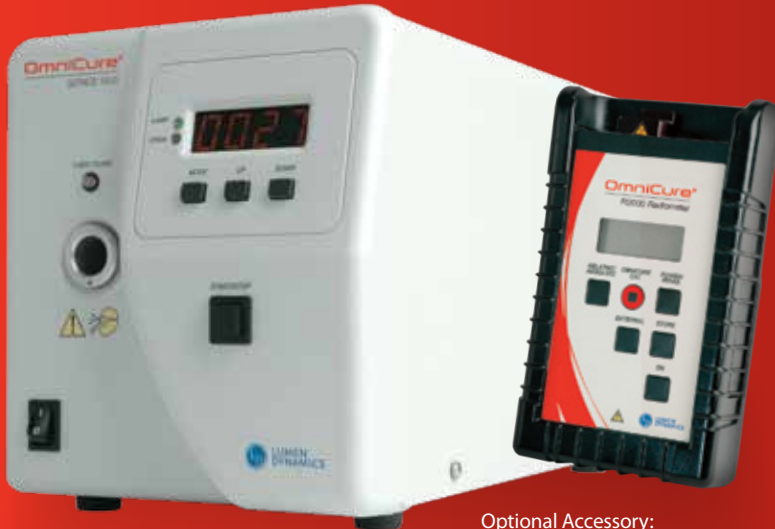
Optional Accessory: OmniCure® R2000 Radiometer

To accommodate various customer needs, the OmniCure® S1500 can be used with four different light delivery options. Ideally used with a multi-legged High Power Fiber Light Guide to cure multiple sites with a single light source, Single-Legged, Liquid-Filled and Fiber Light Guides are also available.