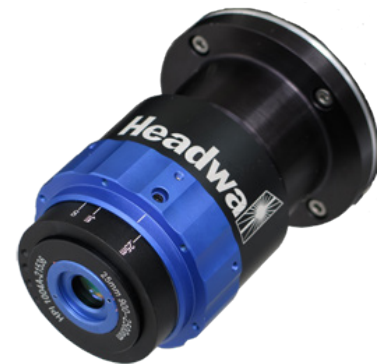
Telecentric lens provides a perfectly matched exit pupil that eliminates unwanted image artifacts.