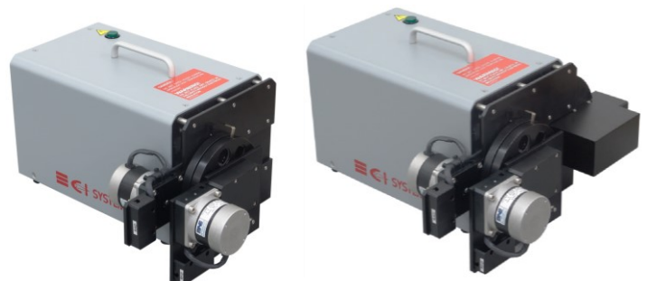
Configuration option: SR-200N Blackbody Head with Motorized Aperture Wheel and Filter Wheel