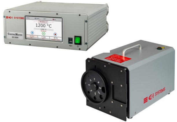
SR-200N Blackbody System Head and Controller