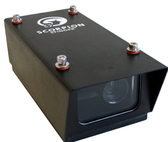
Scorpion 3D Stinger™ Camera

PD-2013-0009-C Scorpion 2D Stinger Camera