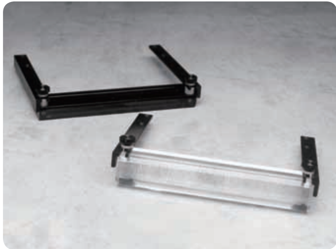
Cylindrical and apertured lenses, A08806 & A08826