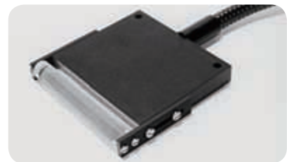
3" (76 mm) Lightline with A08582 Cylindrical Lens