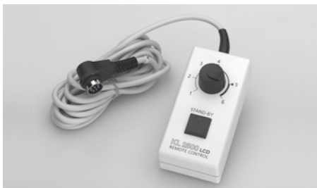
Remote control, P/N 258 402