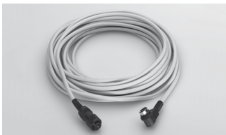
Cable extension, P/N 258 401