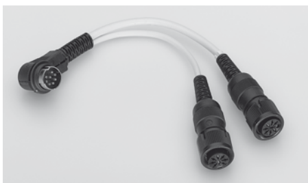
Y-piece, P/N 258 400