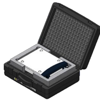
VIB-A-CAS12 Transportation Case