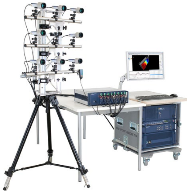
MPV-800 Basic System with 8 optical channels

MPV-800 is designed as a modular system to be used in development labs and test fields. A range of hardware accessories allows to tailor the measurement system to the specific test setup or to simply make storage and handling easier.