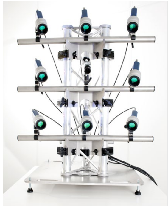
MPV-A-T20 Stand on MPV-A-T20-B Base Plate for low measurement height