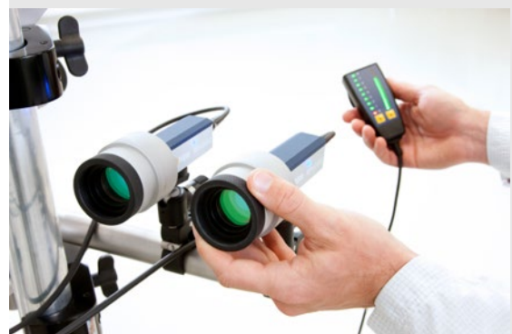
MPV-A-830 Signal level display, for convenient focus optimization