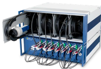
MPV-A-860 Storage System for MPV-O-810 Fiber Heads