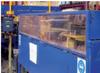
Two of the installed LSV-300 Surface Velocimeters for cut-to-length control at Mueller Copper Tube in Bilston, Great Britain.

The Borusan Mannesmann tube factory, located near Bursa in Turkey, has used a Polytec LSV-300 system since 2006. New meetings took place with their management to furnish all their production lines with LSVs. Erdemir is another leading Turkish tube and metal producer who uses a Laser Surface Velocimeter. Initial tests for cut-to-length control were run at Borusan Izmit factory, where they produce large diameter tubes.