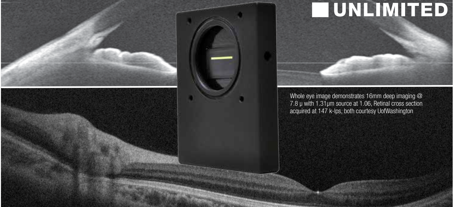
Whole eye image demonstrates 16mm deep imaging @ 7.8 \mu with 1.31 \mu source at 1.06, Retinal cross section acquired at 147 k-lps, both courtesy UofWashington